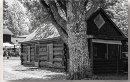
King's Castle, located across the parking lot, is older than the towering white pines that stand on this property!

BENT'S CAMP'S HISTORY IS WONDERFULLY UNIQUE AND HAS BEEN WELL DOCUMENTED OVER TIME. OVER THE PAST FEW YEARS, THE BENT'S TEAM HAS COMPILED ORIGINAL PHOTOS, DOCUMENTS, BOOKS AND FILM TO UNDERSTAND THE COMPLETE HISTORY OF BENT'S CAMP AND THE SETTLEMENT OF THE CISCO CHAIN TOGETHER WITH HISTORIANS, LOCALS, BENT FAMILY MEMBERS AND AUTHOR TRACY WILL WE ARE PROUD TO PRESENT